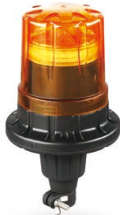
080601AF Flexi Din

ECE R65 TA1, approved. Double waterproof designed to meets IP68. LED ECO energy-saving design. 4 kinds of installation (Flexi Din, Magnetic, Single Point ,3 Point) Lampshade is made of PC, strong tooth structure and stylish design. Operating Voltage 10-30V, Operating temperature -30℃- 70℃. Maximum power 24W. 8 kinds of flash modes (including rotating). Multiple products can be synchronized.