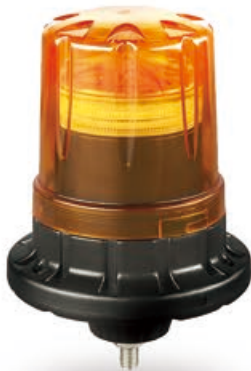
080601AS Single Point